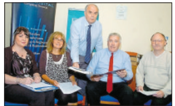
▲ Members of the new Clevedon Enterprise Club.

fidence I needed to set up on my own and by talking to others I soon found a niche."